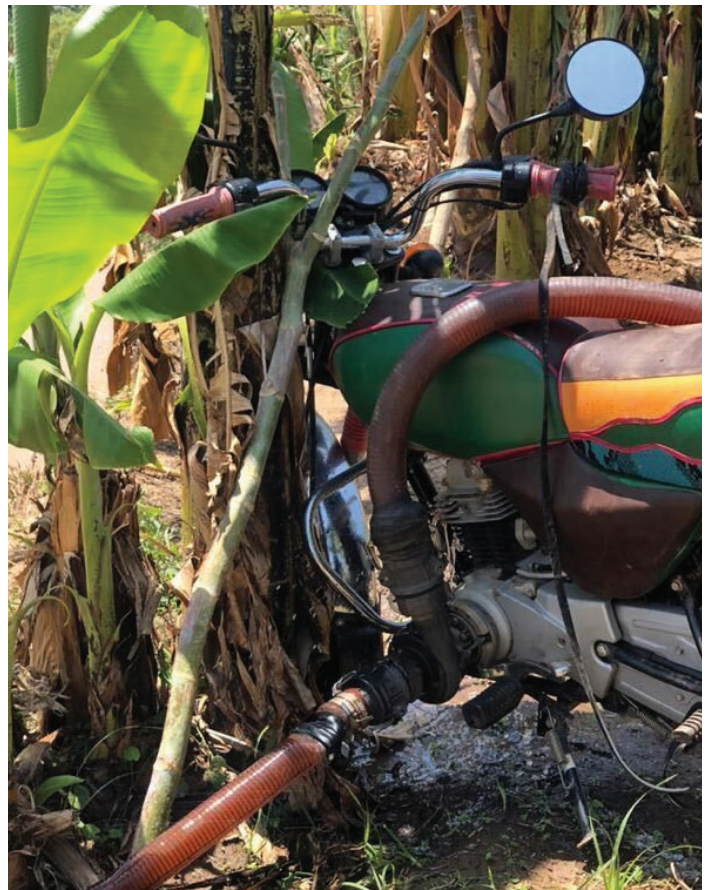
Photo showing the Agriworks mobile, motorbike-powered water pump.

Agriworks' irrigation-as-a-service business model provides a convenient and cost-effective option to smallholder farmers to access irrigation without having to own the irrigation equipment. Agriworks also provides a higher income to local "boda boda" drivers by enabling them to work as irrigation service providers. This business model supports economic development of rural communities by keeping money circulating through the local economy.