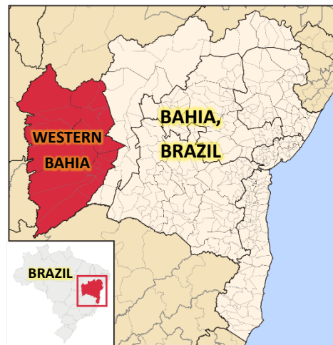
Western Bahia, in red above; Bahia state of Brazil, in red in bottom left corner