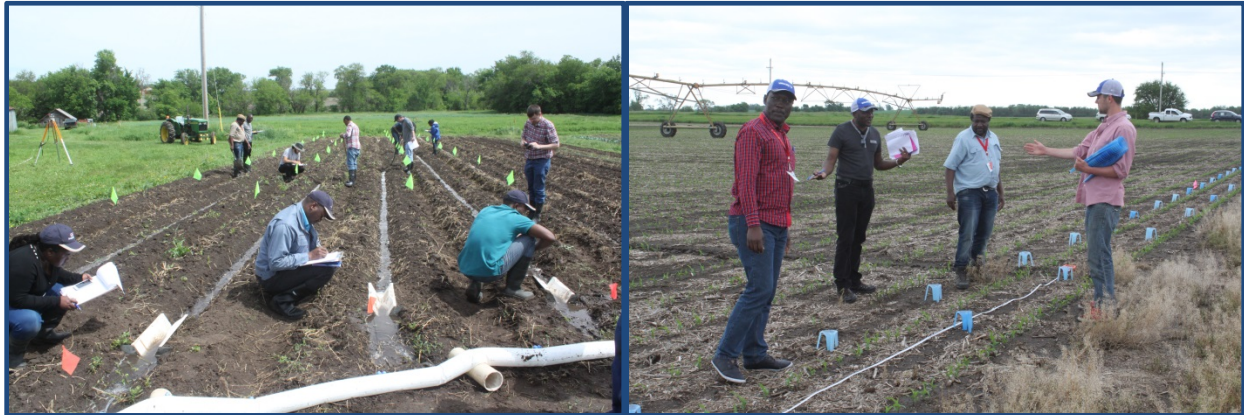
Hands-on learning is an important part of DWF/IHE Partnership Programs 1

These graduates' newly earned expertise in agricultural water management will be of tremendous benefit in their home countries, where their knowledge can help inform policy making and best practices. In all three cases the graduates work for action agencies or consultancies – all of which have great influence on water use in their region of the world.