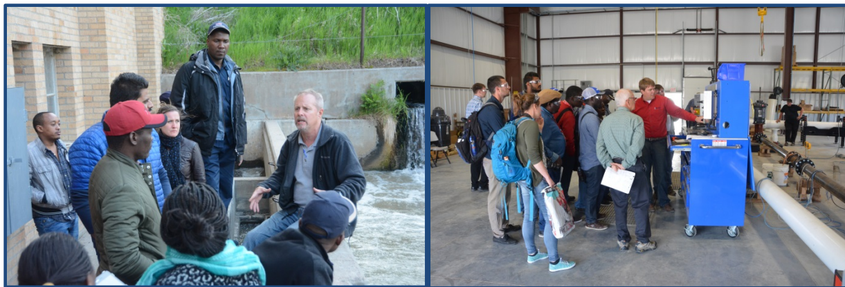
Students learn from irrigation district and industry cooperators 2