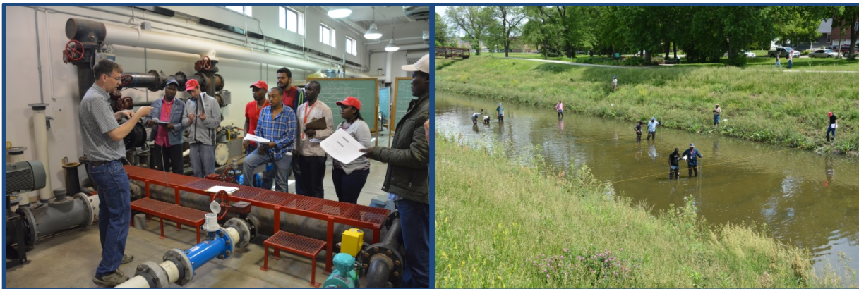
Students experience both indoor and outdoor laboratories 2

Sharing expertise between IHE and the University of Nebraska through DWFII was one of the objectives of the original MOU between IHE and DWFII. The organizations accomplished this goal through the field courses, double Master of Science degree program, the cooperative research programs that have been initiated and the faculty exchanges. This has enriched the educational opportunities for all of the students involved and has set the framework for future collaborative education and research between the faculty at IHE and the University of Nebraska. Research findings and gained knowledge will contribute to a number of global efforts to increase water and food security for our world.